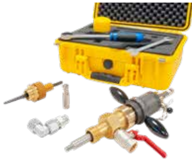
Hot tap drill - Exclusive model