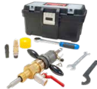
Hot tap drill - Economy model